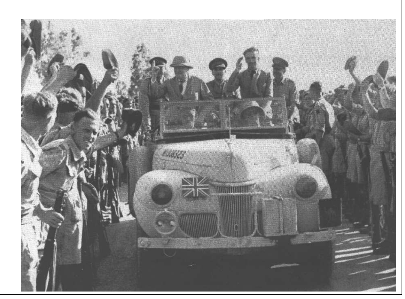
What type of WWII vehicle is this? Note: The user modified it. Answer is on page 13.

WESTERN COMMAND MILITARY VEHICLE HISTORICAL SOCIETY