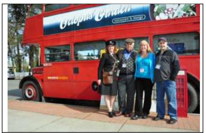
The Newby Clan with their 1961 Leyland bus.