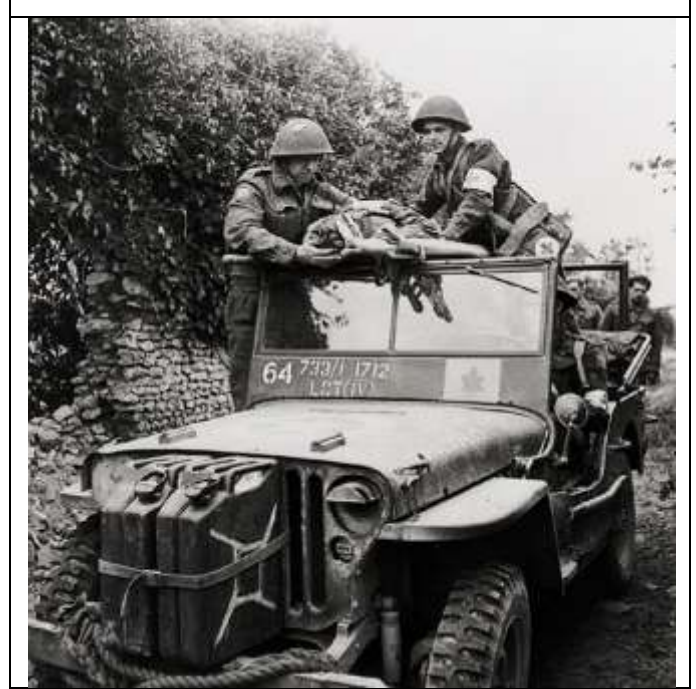
6. Clue - look under grille to right of Jerrican.