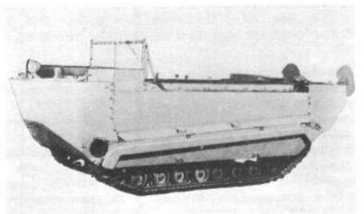
Carrier, Cargo, Amphibian, M29C (Studebaker 'Water Weasel') 6-cyl., 65 bhp, 3F1R \times 2 (2-speed final drive at rear), 192 \times 67 \ \text{\em X} \times 71 (54) in, 4778 lb. 20-in tracks. Ground pressure 1-93 lb/sq in. Water propulsion effected by the tracks. Speed in water approx. 4 mph. Controlled differential.

1945 U.S. Studebaker M-29C "Water Weasel' SN 8761 1945, rebuilt 1955 US Army ("LKY")WWII amphibious (with floatation tanks). Good for snow, mud etc. NOT RUNNING. (Photos show engine head is off, radiator loose etc.) Has data plates (some are arsenal rebuilt hand stamped) and both Missing floatation tracks. HISTORICAL NOTE FROM EDITOR: The Weasel was original developed for the First Special Service Force (The Devil's Brigade) in WWII for a special mission to Norway which was cancelled. Weasels were very successful and were used on Kiska invasion, in Italy I believe and in North West Europe. U.S. General MacArthur used one. Used by Canadians in Holland due to flooding. Located in Victoria, BC $2,800 Andy Jones 250-217-5022 (Non-member)