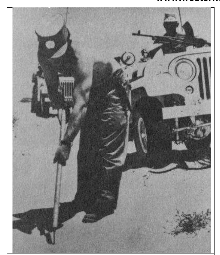
11. 1953 mfg.