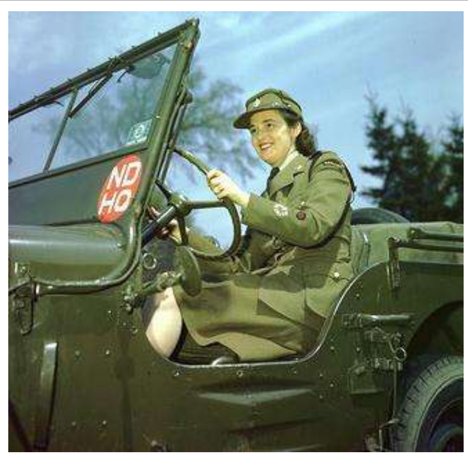
Willys WL-U 440-M-PERS-1 jeep at NDHQ, Ottawa in WWII