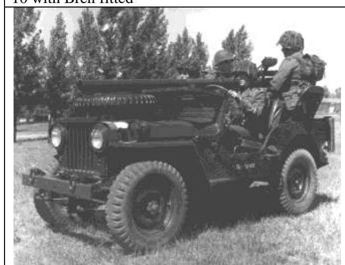
10 with 106mmRR fitted