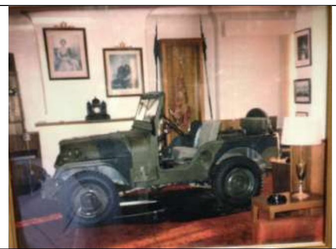
12 parked in BCR Officer's Mess courtesy of our Secretary