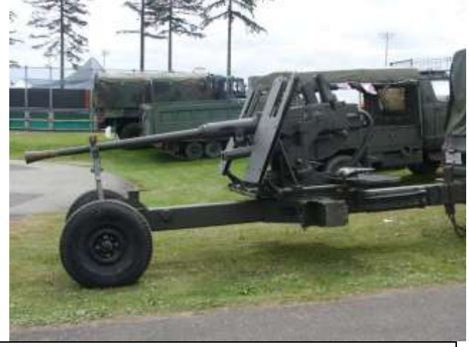
40mm Bofors anti-aircraft gun.