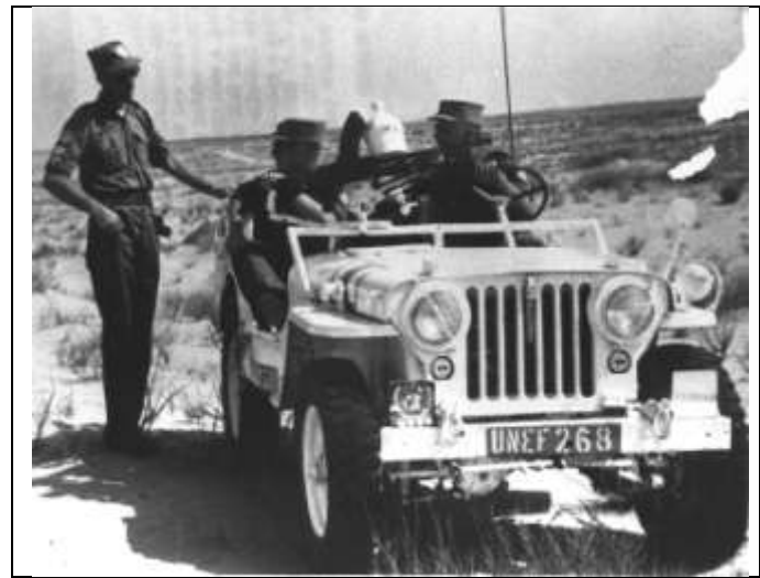
10 with Bren fitted