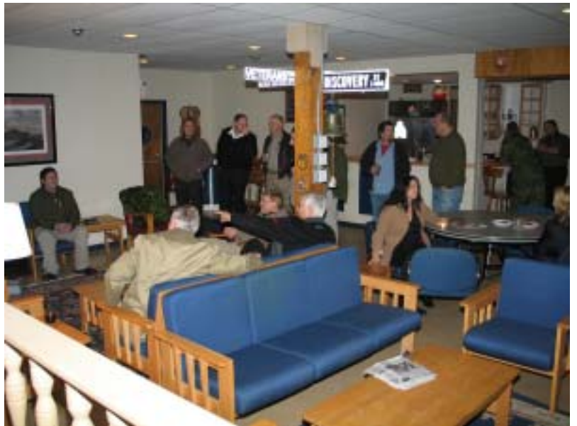
Members enjoying a few drinks at the Western Command Christmas party in the Seamen's Mess at HMCS Discovery 1 December 2008