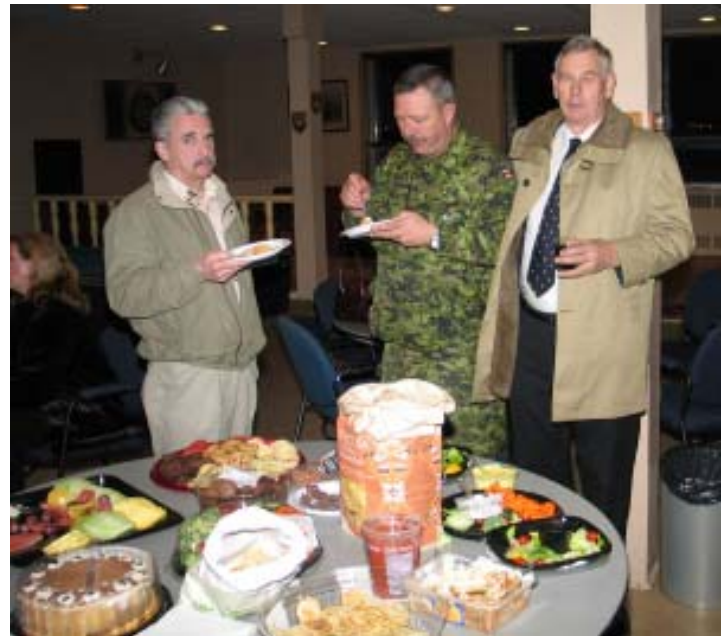
Three amigos guarding the rations table